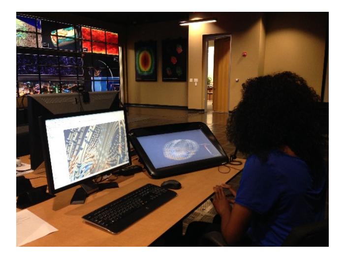
Figure 3: ParaView running on zSpace

In order to run Immersive ParaView on zSpace, we also need the configuration file for the display setup and the configuration file for the input connections [9]. The wiki page for Immersive ParaView [9] has examples and GUI snapshots on how to create the two configuration files needed. Figure 3 shows ParaView running on the zSpace system.