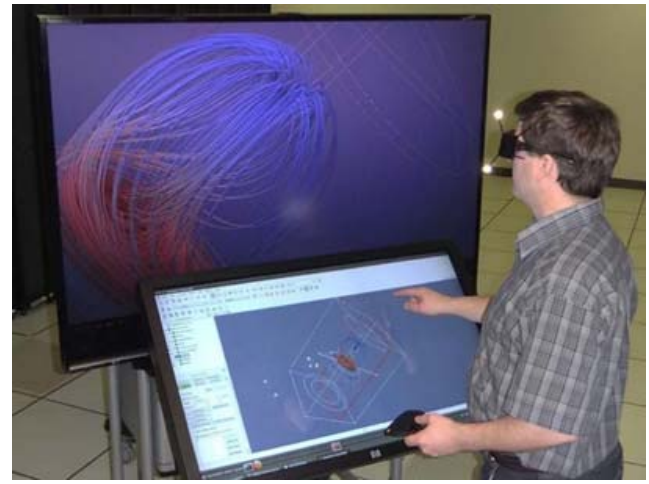
Figure 2: Immersive Visualization through integrated touch screen interface

The question of the effectiveness of using an immersive visualization tool in the scientific visualization workflow to improve understanding of the data has been of great interest to the visualization community. An example of this is Immersive ParaView [1].