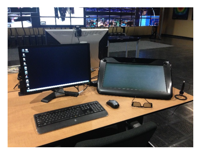
Figure 1: Hardware systems setup

The hardware platform includes a desktop computer with an AMD FirePro V7900 (FireGL V) Professional Graphics Card. The W5100 graphics card has 4 outputs, and in our setup, we have a regular LCD monitor, and the zSpace [5] monitor, all attached to the graphics card.