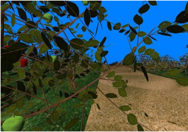
Figure 1: The virtual orchard

Virtual baskets are placed behind the patients back at the level of the shoulder and the waist. The patient is required to visually locate the apple, reach and grasp it, and place it into the appropriate basket (green apple → top basket = external rotation, red apple → lower basket = internal rotation). Audible feedback (noise of apple dropping) is given when sufficient rotation to reach the correct basket is achieved.