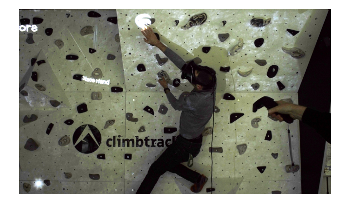
Figure 4: A VR user climbing in the SR climbing system. The bystander observes the ascent using our projection-based interface and switches to midnight in the IVE by pressing a button on the controller. To help the climber, the bystander uses the controller as a virtual flashlight inside the IVE. The bystander thereby points "into the IVE" and lights up a hold on the virtual rock to guide the immersed climber.

objects in the room, bystanders could interactively swap the virtual substitutes of physical objects to help the user by fulfilling a task in the IVE.