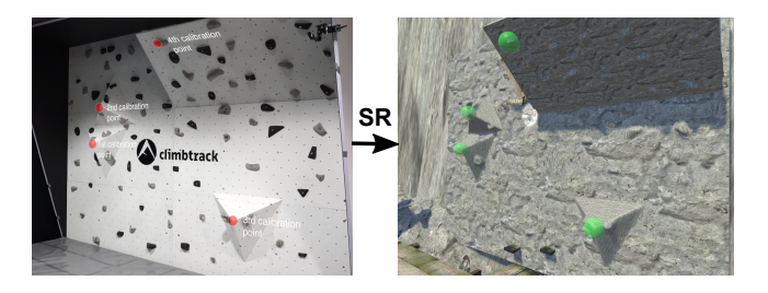
Figure 1: The main substitution of the SR climbing system. The physical climbing wall is substituted by a virtual rock wall inside an immersive virtual mountain environment [7].

<sup>4</sup>http://www.keeptalkinggame.com/