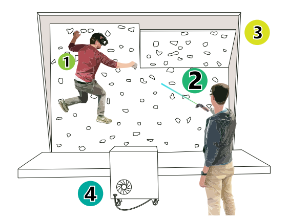
Figure 3: The setup of our projection-based interface. The VR user (1) physically climbs in a SR climbing environment while being immersed wearing a HMD. An active spectator (2) observes the climber's ascent and suggests a hold by pointing into the virtual environment with an HTC Vive controller. Meanwhile, the physical environment (3) is transformed into a spatial augmented reality experience as a project tor unit (4) projects the substitutional environment onto the physical environment. In combination with the sounds of the substitutional environment played by the projector unit, this allows the spectator to semi-immersively perceive the IVE.

We implemented this concept in the SR climbing system, as sketched in Fig. 3, to provide an interface for trainers and other active spectators, which allows them to adapt the climbing environment. As illustrated in Fig. 4 and Fig. 5, bystanders can point a virtual flashlight at holds on the wall to aid the immersed climber. Moreover, active bystanders can trigger specific events in the IVE like day and night changes or falling rocks. These events can be regarded as Aesthetic changes or Addition/Subtraction events controlled by the semi-immersed bystander. To demonstrate interactive