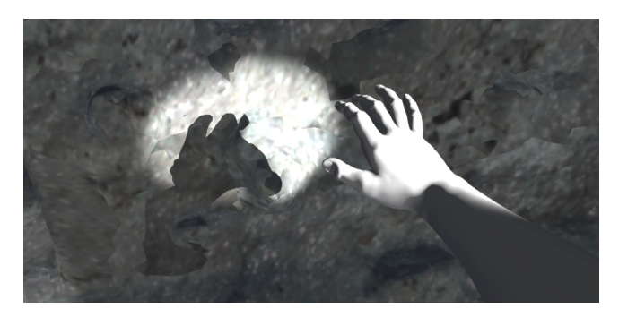
Figure 5: View of the immersed climber wearing a HMD. The climber sees the virtual flashlight of the bystander in the IVE. The light highlights a hold on the virtual rock, guiding the climber through the simulated SR night climb.

In this work, we introduced a projection-based interface for bystanders of SR experiences. The introduced system is based on previous work about projections in everyday environments [4,5] and enables bystanders to perceive the substitutional environment in a semi-immersive way. We identified two types of bystanders, passive and active spectators, and summarized their general requirements for such an interface. Passive spectators aim to perceive the SR while maintaining an overview of both the real and virtual environment. In addition, active spectators also want to interact with the virtual environment while observing the experience of a VR user. To meet the requirements of passive and active spectators, our proposed interface provides audio feedback by playing the sound of the IVE and projects the virtual substitutions onto their physical counterparts in the real environment. This allows bystanders to perceive the IVE and spatial relationships between the immersed VR user and the substi-